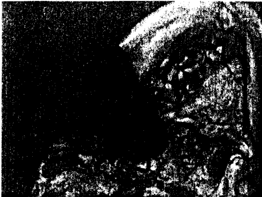
FIG. 4. Medial pterygoid. The utility of injecting this muscle in most instances is questionable because adequate relaxation of the masseter and temporalis jaw-closing muscles appears to provide enough clinical effect to relieve pain and reduce joint loading.