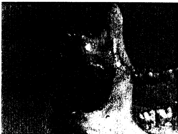
FIG. 5. Lateral pterygoid. This small muscle requires EMG guidance for injection because of size and location. The approach is operator-dependent, either extraoral or intraoral.

This small muscle requires EMG guidance for injection because of its size and location (Fig. 5). The approach is operator-dependent, either extra- or intraoral. Using the extraoral route involves establishing the location of the condylar head by palpation as the patient demonstrates a full range of mandibular motion. The needle is inserted through the skin in the coronoid notch area and is advanced at 45° posteriorly to gently engage the condylar head. The needle is then withdrawn slightly and advanced more anteriorly and slightly deeper. The patient is then asked to mobilize the mandible from side to side, and aspiration and injection are performed once proper position is ascertained. The intraoral approach involves access posterior to the maxillary tuberosity in a lateral direction. Once the needle is inserted through mucosa, it is helpful to visualize the patient's ear (knowing