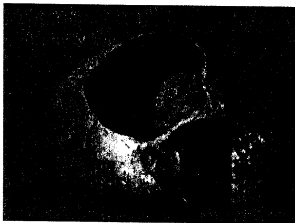
FIG. 3. Injection technique for the masseter muscle. Approximately five diffuse injections into the masseter muscle are recommended, preferably targeted to areas of highest activity on EMG, greatest muscle bulk, and/or greatest discomfort. Care must be taken with anterior and superior injections of this muscle because diffusion of botulinum toxin to the zygomaticus major muscle nearby may prevent the patient from raising the corner of the mouth, causing an asymmetric smile.

The medial pterygoid muscle lies on the medial surface of the mandible and is somewhat difficult to reach (Fig. 4). The utility of injecting this muscle in most instances is questionable because adequate relaxation of the masseter and temporalis jaw-closing muscles appears to provide enough clinical effect to relieve pain relief and reduce joint loading. The muscle can be injected extra-orally via a submandibular route. However, the angulation does not lend itself to good visibility or easy access to the superior aspect of the muscle. The intraoral approach allows palpation of the muscle before injection except when the patient has a sensitive gag reflex or limitation in oral opening. In either technique, care must be taken to stay within the muscle because superior medial injection can approach the infratemporal fossa and its contents. Branches of the external carotid artery, branches of the trigeminal nerve, and muscles of the pharynx can be adversely affected. Inferior medial injection outside the medial pterygoid can affect the submandibular gland as well as muscles of the floor of the mouth. EMG guidance is therefore required.