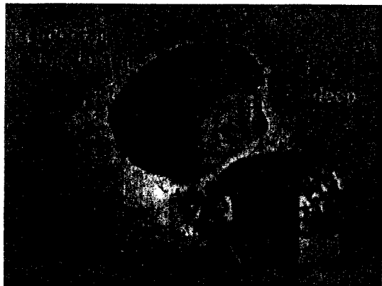
FIG. 2. Injection techniques for the temporalis muscle. Two types of injection are usually used to adequately weaken the temporalis muscle, superficial and deep. Superficial injections are administered into the thinner upper regions of the muscle in a fan shape. A single deep injection can also be administered, as shown, but particular note must be taken of the split of the superficial temporalis fascia approximately 1.5 cm superior to the zygomatic arch. In this area there are two superficial fascia layers with fat in between, whereas the muscle is deeper. If the operator uses the tactile sensation of penetration of the needle through fascia as a guide for injection, two penetrations are necessary in this area.

variable expanse and depth. Two types of injection, superficial and deep, are usually used to adequately weaken this muscle (Fig. 2). Superficial injections are performed into the thinner upper regions of the muscle in a fan shape. No special precautions are required, although advancing the needle too deeply engages bone and damages the needle. The deeper single injection requires special anatomic consideration. For this injection, particular note must be taken of the split of the superficial temporalis fascia approximately 1.5 cm superior to the zygomatic arch. In this area there are two superficial fascia layers with fat in between, whereas the muscle is deeper. If the operator uses the tactile sensation of penetration of the needle through fascia as a guide for injection, two penetrations are necessary in this area. This latter injection is probably very useful because the muscle in this area is the thickest before insertion on the coronoid process of the mandible. Aspiration before injection is critical because large vessels course through this field.